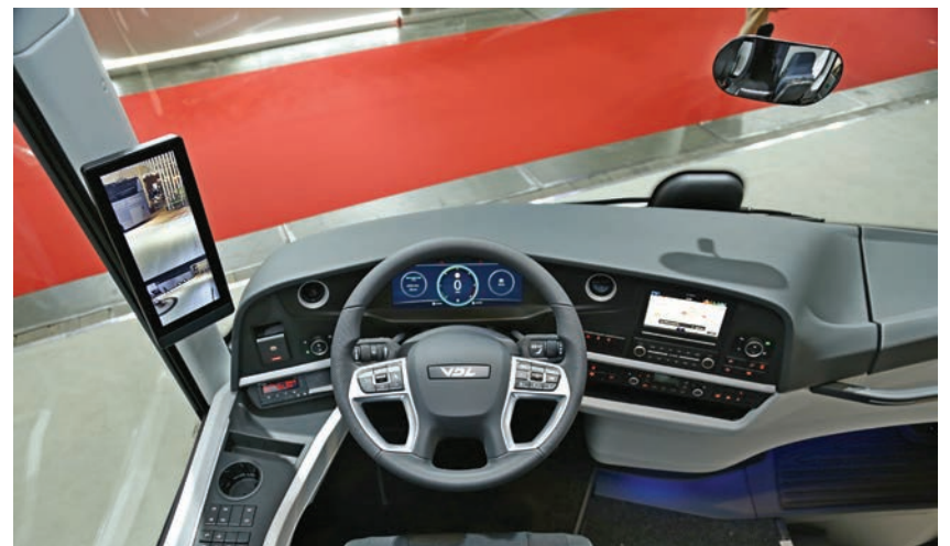
Easy to use ergonomic dashboard.

"We are proud of our employees who showed their craftsmanship during