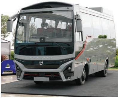
Renewed Prestij midibus.

Nearly ten years after its first major update, Turkish manufacturer Temsa is unveiling the completely renewed Prestij, a model characterised by modern design, efficiency, and advanced safety features.