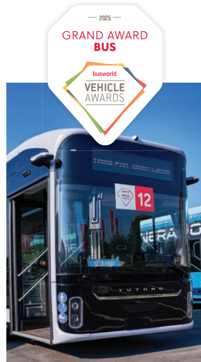
YUTONG BUS U15