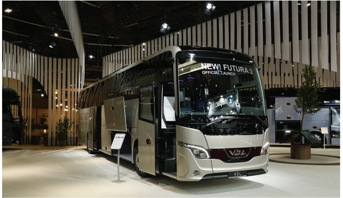
New aerodynamic front; 15% less fuel.

The new coach features a completely new interior concept. Passengers will be seated on VDL Class 300