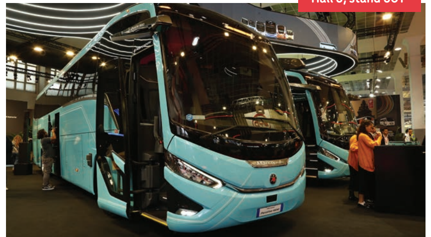
Marcopolo coaches are currently undergoing homologation for the European market.

The Paradiso G8 1200 is currently undergoing homologation tests to be approved for European roads. In addition to the usual technical requirements, the vehicles must also comply with cybersecurity standards . Marcopolo expects the first deliveries to take place by the end of 2026 .