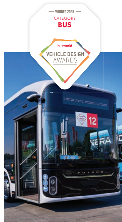
YUTONG BUS U15

For the very first time in its history, Busworld has grants the Vehicle Design Awards. A jury consisting of specialized design professionals took a look at the exterior and interior of all buses and coaches present at Busworld Europe 2025 over the past few days. Taking all the design aspects into consideration they unanimously came to the conclusion that the Yutong Bus U15 is the winner of the first Busworld Vehicle Design Awards in the category Bus, and the VDL Bus & Coach Futura 3 in the category Coach.