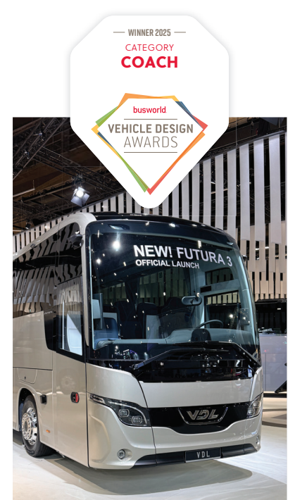
VDL BUS & COACH FUTURA 3