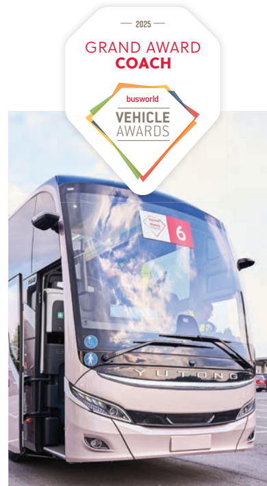
YUTONG BUS T14E